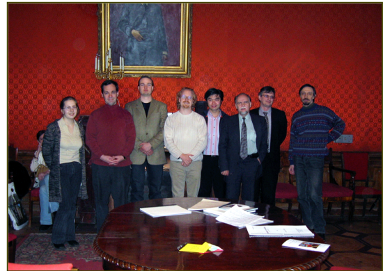
Composers' meeting in the "House of Composers"